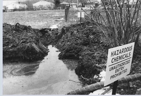
Love Canal, New York